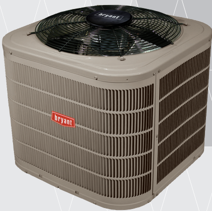
Models 127T, 126S